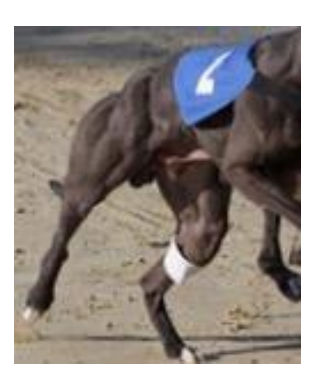
The left hind leg may be taped to prevent tibial periostitis (track leg) due to the impact of the tibia against the elbow